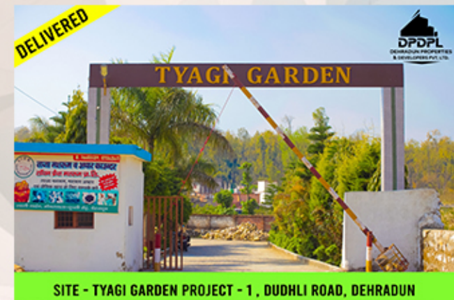
SITE - TYAGI GARDEN PROJECT - 1, DUDHLI ROAD, DEHRADUN

View More Completed Project On www.dehradunproperties.co.in