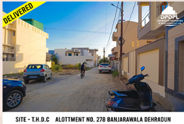
SITE - T.H.D.C ALOTTMENT NO. 278 BANJARAWALA DEHRADUN