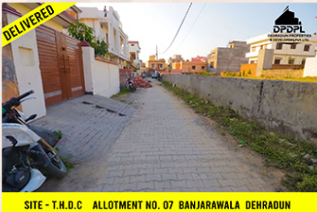
SITE - T.H.D.C ALLOTMENT NO. 07 BANJARAWALA DEHRADUN